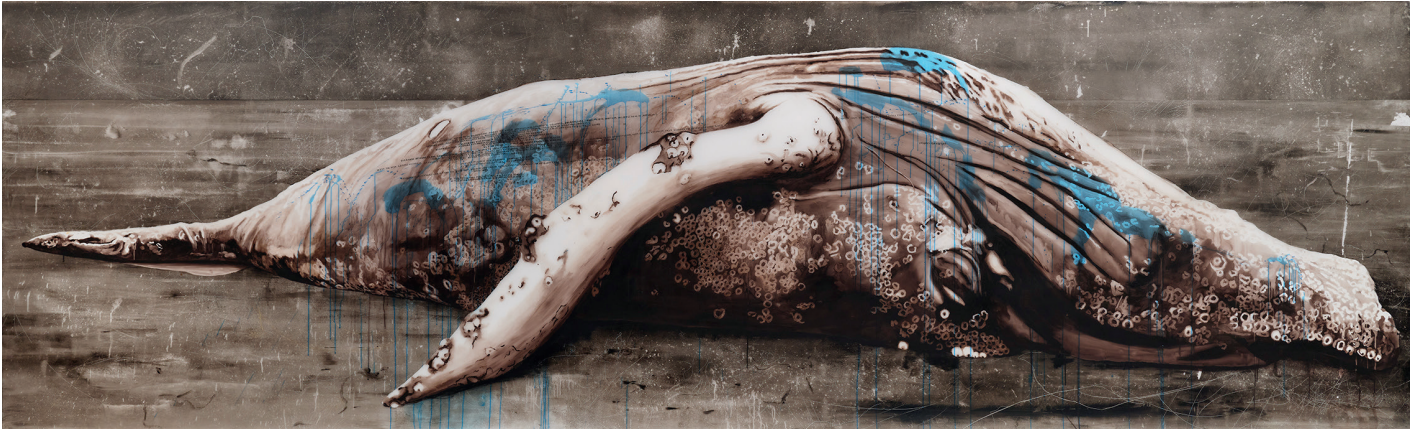
Naufraiges - Deuxième chant - Acrylic, gouache and Posca® on polyester - 152 x 500 cm

After a year's absence, the Huberty & Breyne gallery is back centre stage for the 2024 edition of the international Art Paris Art Fair with a solo show dedicated to the work of contemporary French artist Gilles Barbier.