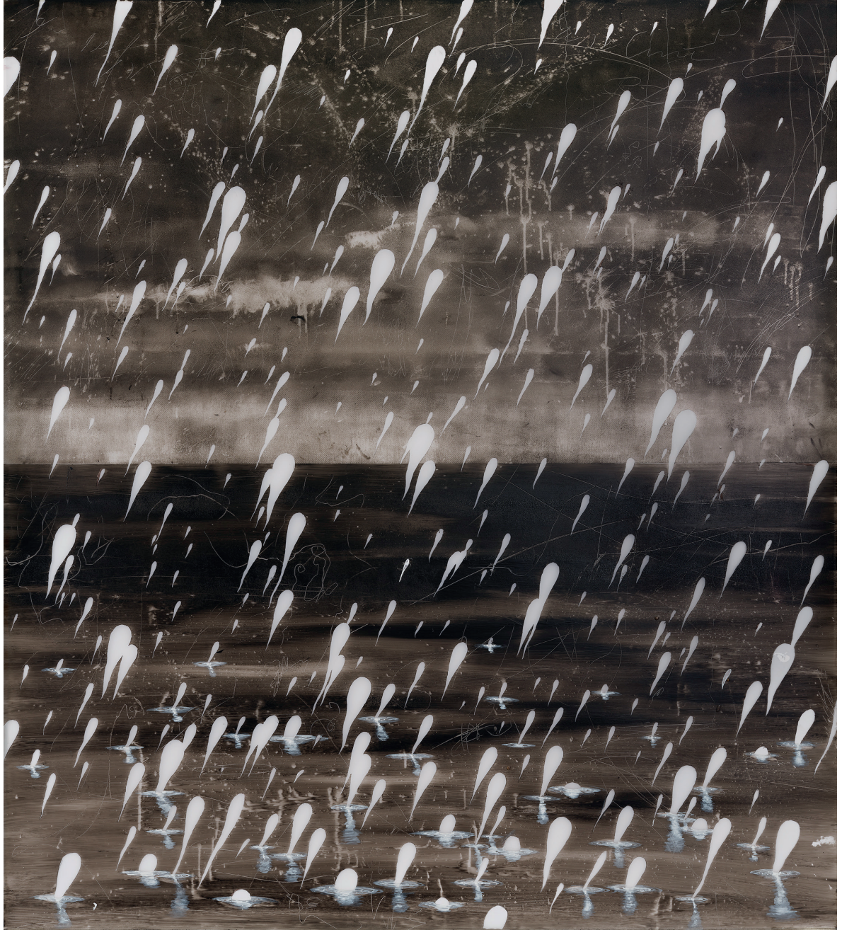
Naufages - Les Hallucinations #1 (La pluie qui monte) - Acrylic and Posca® on polyester - 170 x 152 cm